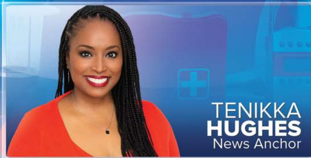
TENIKKA HUGHES News Anchor